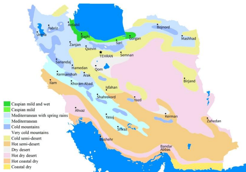
Figure 1. The map of Iran with different climate regions (Iran-climate.png.). This figure is shared under a CCBY 3.0 Share-Alike 3.0 Unported license.