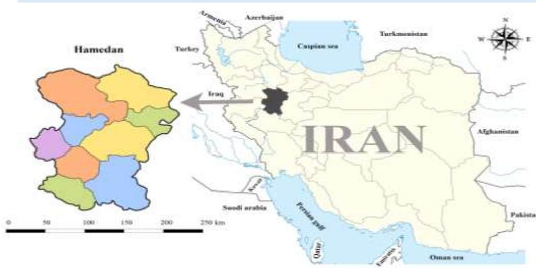
Figure 1. Location of Hamedan province, sampling area, in the western part of Iran.

mM oxalic acid (10: 20: 70 %). Mixed standard solutions were then prepared for simultaneous calibration and calculation of TCs residues (9).