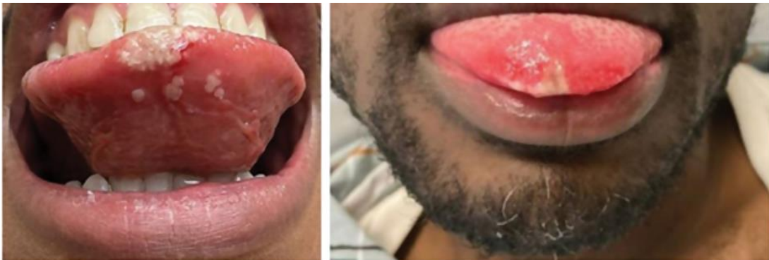
Figure 2. Oral lesions of monkey pox.