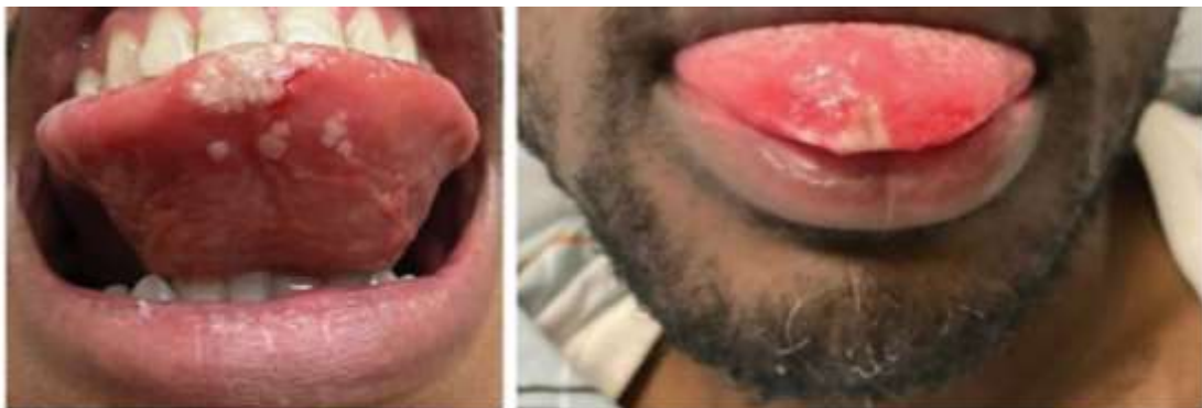
Figure 2. Oral lesions of monkey pox.