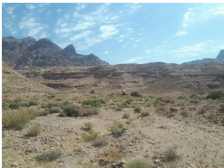
Figure 5. Habitat of E. walteri at a locality, Ghotrom village that 46 km southeast of Bafgh County, Yazd Province, southeast Iran.