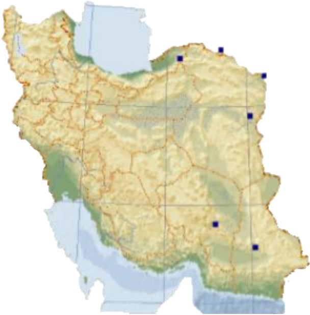
Figure 1. Current Range of Eirenis walteri distribution in Iran.