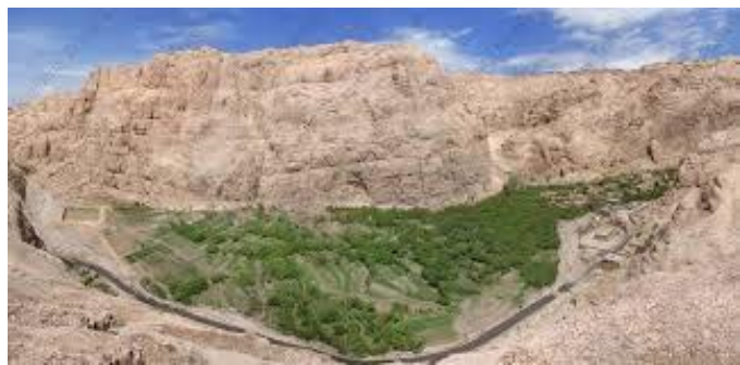
Figure 2. Ghotrom village in Kouh-e-Bafgh Protected area.