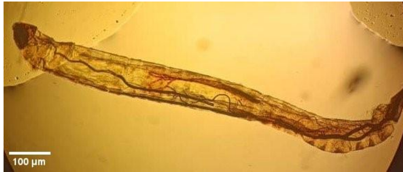
Figure 1. P. albipennis . larvae collected from patients' urogenital tract under microscopic magnification.