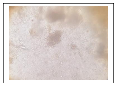
Figure 1. Eggs of Haemonchusspp unstained isolated from infected goat (40X)

The present study showed that the duration of hematologic changes was significantly different between infected and non-infected controls. The data indicated that the goats infected by Haemonchosis have a gradual decline in Hb concentration, pocket cell volume (PCV) and total erythrocyte count compared to healthy control animals. Furthermore, total leucocyte count, lymphocyte and neutrophil were significantly decreased (P<0.05) in infected goats post-infection. However, eosinophil count showed a significant increase (P<0.05) in the infected animals. In addition, Basophil count showed non-significant changes during the period post-infection compared to control, as shown in the table 3.