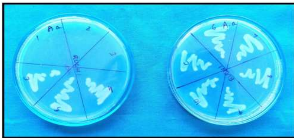
Figure 2: MBC of Anethum graveolens extract against Aggregatibacter actinomycetemcomitans .

All values are expressed in mg/ml against tested organism.