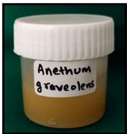
Figure 3. Anethum graveolens gel.

e) 0.5% of triethanolamine was added dropwise. The mixture was then added to the previously prepared triethanolamine solution, which had been prepared dropwise, and stirred using a high-speed propeller stirrer at 1200 rpm for 30 minutes. The gel was then exposed to UV irradiation for 20-30 minutes. It was then transferred into an airtight container (Figure 3). The gel was stored at ambient temperature for future use.