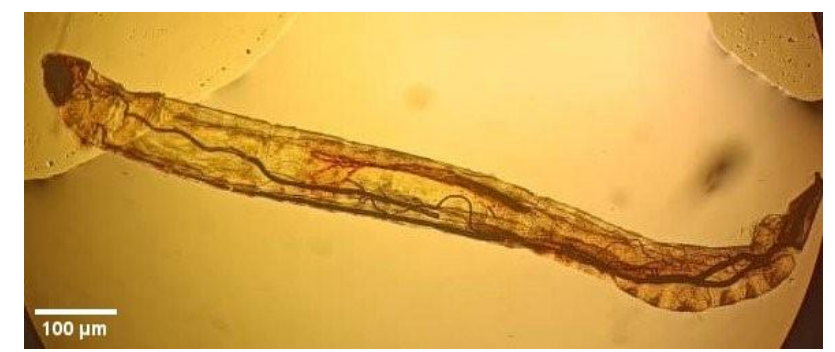
Figure 1. P. albipennis. larvae collected from patients' urogenital tract under microscopic magnifacation.

Larki et al / Archives of Razi Institute, Vol. 79, No. 5 (2024) 1117-1120