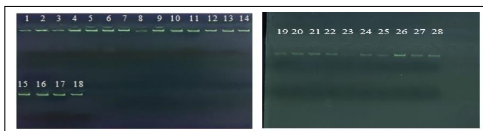
Figure 1. The bands of gDNA were on 0.5% agarose gel at 60 volts for 30 min with adding 3 \mu l red safe. Lane 1-28 genomic DNA extracted from blood samples used in the present study

The Polymerase Chain Reaction (PCR) technique amplified for genomic DNA to study the impact of the Insulin-like Growth Factor 1 Receptor (IGF1R) exon 2 gene in Fallow deer production. The PCR product of the target gene was tested by 2% agarose gel electrophoresis with 1X TBE buffer. The bands of candidate genes appeared at 380 bp using pairs of primer prepared by Integrated DNA Techno (IDT) company/Canada (Figure 2).