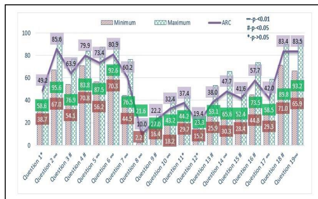
Figure 1. Maximum, average, and minimum levels of complete answers to individual items of the questionnaire in different centers (%)

The summary data on the levels of correct answers to all questions of the questionnaire are presented in figures 1 and 2.