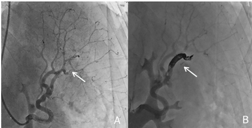
Figure 1. Angiography: A. Splenic artery with extravasation (arrow); B. After embolization with coils and liquid embolic agent (arrow)