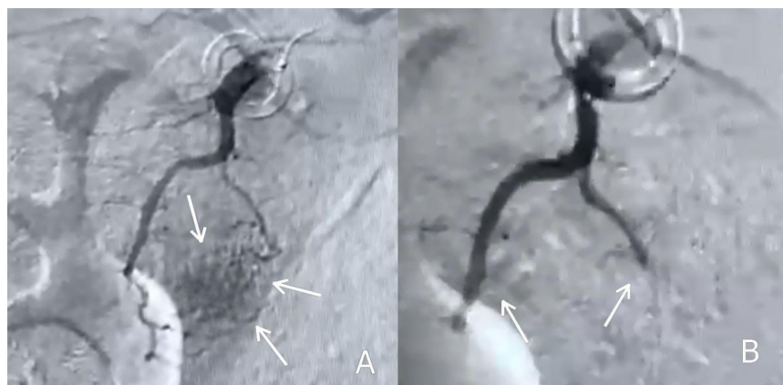
Figure 3. Angiography: A. Gastroduodenal artery with extravasation (arrows); B. After “distal” embolization with embols (arrows)