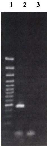
Figure 1. Optimization of PCR conditions using positive and negative controls. A 468bp fragment was observed in a 1% agarose gel. Lane 1: DNA size marker (Ladder 100), lane 2: BHV-1 as positive control, lane 3: uninoculated MDBK cell culture as negative control