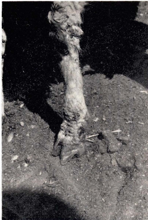
Fig. 2. Lesions of dermatitis due to D. dermatonomus on the leg of lamb.