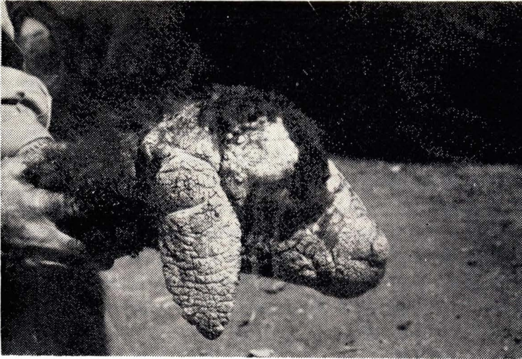
Fig. 1. Lamb showing lesions of severe dermatitis due to D. dermatonomus on ears and face