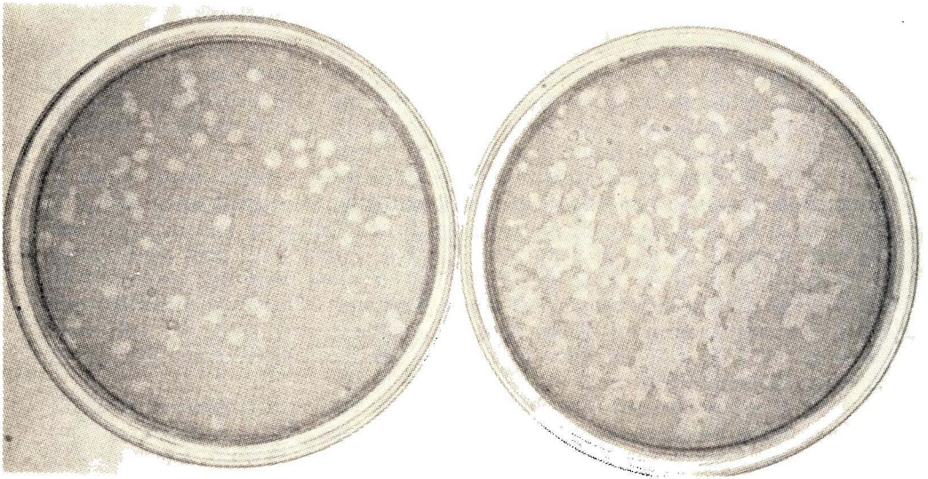
FIG. 1. BSC-1 cells 5 days after inoculation of mouse-adapted measles virus (left) and Edmonston measles virus (right); the cells were maintained under an agar overlay to prevent secondary plaques from developing.

Induction and assay of interferon. Interferon induced by the mouse-adapted measles was prepared by the technique suggested by Desmyter et al. (5) and described in detail by Mirchamsy and Rapp (6). After 72-hr incubation of virus with the cells, the culture fluids were decanted, acidified to pH 2 for 48 hr, adjusted to neutrality and centrifuged two times in a Spinco model L2 ultracentrifuge. To assay the interferon, 3.5 ml of Eagle's plus 2% FBS was added to the petri dish cultures of BSC-1 or Vero cells. Then 0.5-ml dilutions of interferon were added and allowed to incubate for 18 hr at 37° in a CO 2 incubator. The fluids were then removed, the cells were washed with Eagle's medium and challenged with 70-100 plaque-forming units of vesicular stomatitis virus. The challenge virus was allowed to adsorb for 1 hr, and the cultures were then overlaid with a medium consisting of 1% agar in Eagle's medium, 10% FBS, 1:30,000 dilution of neutral red, and 0.23% sodium bicarbonate. The interferon titer was expressed as the reciprocal of the interferon dilution which resulted in a 50% reduction in the number of plaques induced by vesicular stomatitis virus.