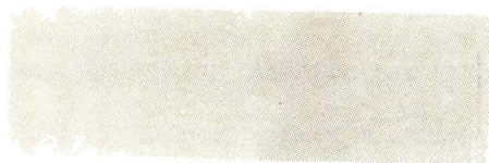
Fig. 1, Electrophoresis of a normal serum ceruloplasmin

By the paper electrophoresis, 50 to 100 microliter of serum were fractionated with the Elphor electrophoresis apparatus, using sodium barbital/Sodium acetate buffer, and for the staining a 0,5% of P. Phenylendiamin, 2 HCl were employed. Using the electrophoresis technique for the ceruloplasmin activity, the serum of patients showed no or a trace activity in the ceruloplasmin fraction, but the normal sera has a good activity in the ceruloplasmin fraction, Fig. 1 and 2.