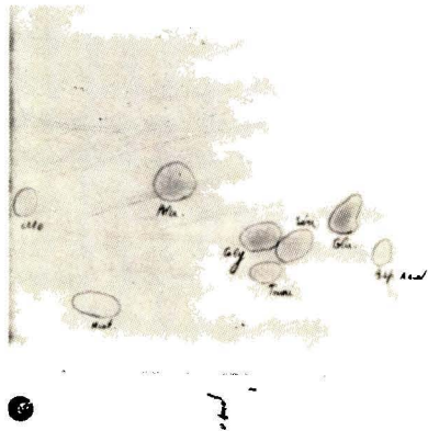
Fig. 3, Amino-acid chromatography of normal urine.

By the described above technique, we have observed from 12 to 18 differents amino-acids in the urine of the patients, with notable increase in: Serine, lysine, threonine, alanine, glycine, glutamic acid, cystine, glutamine and histidine; and less well marked were observed for aspartic acid, proline, tyrosine, valine, leucine, and iso-leucine. Fig 3 and 4.