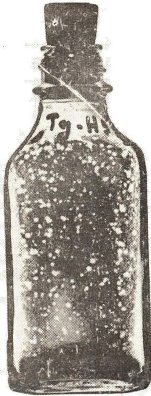
Fig. 2. Plaques in monkey kidney cell line produced by AHSV, 5 days after seeding.

two logs in titer for virus kept at 25° C and a nearly complete inactivation for virus maintained at 36° C for the same period of time. Another point of interest is the stability of plaque size during thermal inactivation. Suspension of virus kept for twenty-four days at 36° C showed minute plaques of less than 1 mm. and large plaques of 2—5 mm. (Fig. 2). This is in agreement with our previous finding for all 8 types of AHS viruses freshly harvested from MS tissue culture.