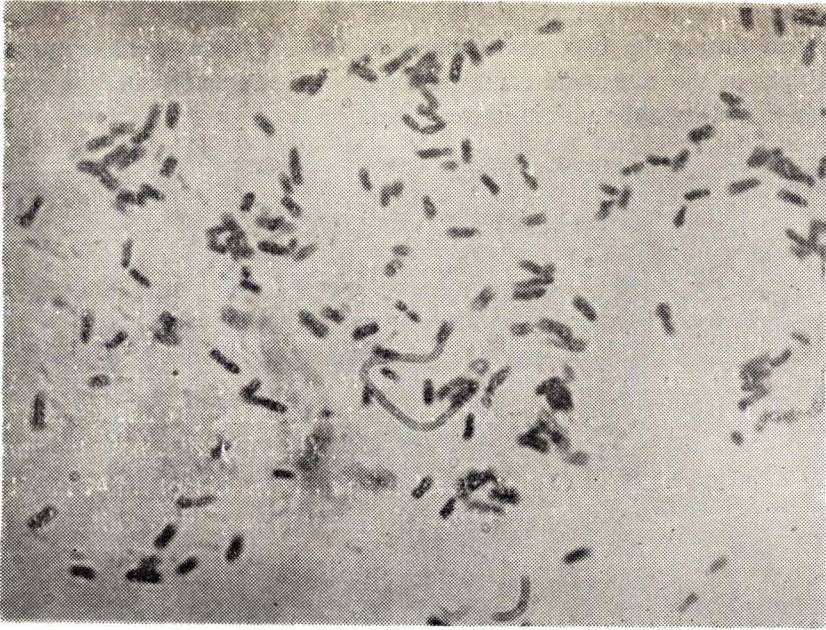
Fig. 2- Numerous disseminated bacterial colonies were noted in the tissues.