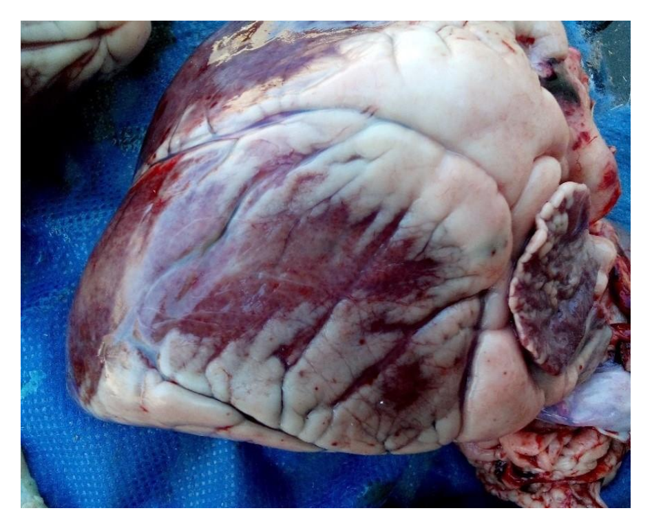
Figure 4. Petechial hemorrhage on epicardium