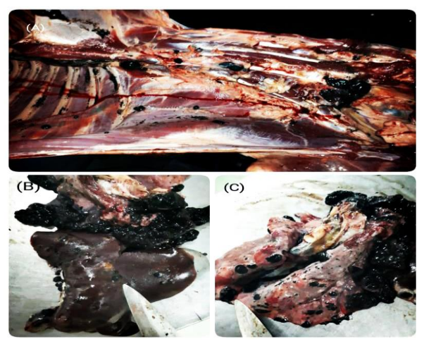
Figure 1. (A) Caprine non-cutaneous malignant melanoma. Multifocal nodular melanotic tumors scattering on visceral surfaces

The case under study was observed in an industrial slaughterhouse in Tabriz, Iran, during 2018. Some multifocal to coalescing round firm black masses with the diameter of 1-3 cm scattered on visceral surfaces of the carcass, serous membranes (Figure 1A), and some organs, especially the liver (Figure 1B) and the lungs (Figure 1C) were found during the inspection. These findings led to the suspicion of malignant melanoma. Afterward, several pieces of the lesions were fixed by 10% formaldehyde, and sections from paraffin embedded blocks were cut at 5 microns and presented for histopathologic details through routine H & E staining method (Murray et al., 2004).