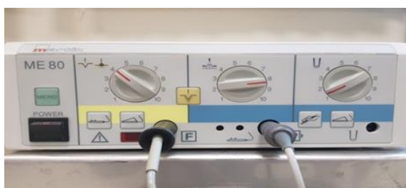
Figure 1. Electrosurgery unit (Bovie machine)

Electrosurgery Unit and Animal Preparation. The electrosurgery unit (Bovie machine; Figure 1) used in this study was KLS Martin ME 80 (KLS Martin Group, Germany). This unit has three main parts, including 1) monopolar electrodes (Surgi-pen; Figure 2) attached to a needle electrode with 0.4 mm outer diameter to make an incision in the skin, 2) rubber neutral electrode for children (8×16 cm; Figure 3) with a single contact surface of 120 cm 2 , and 3) monopolar double-pedal footswitch (Figure 4). Several serious precautions should be followed while performing electrosurgery as a preferred surgical method. To avoid animal burning it is necessary to ensure that the animal back skin is fully connected to the rubber neutral electrode; therefore, before putting the mouse on the rubber neutral electrode, it is required to cover the back skin with a water-based lubricant.