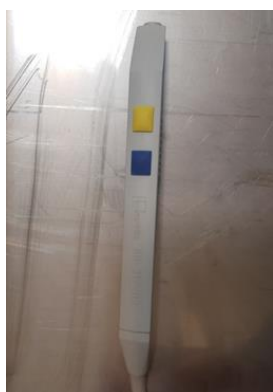
Figure 2. Monopolar electrodes (surgi-pen) equipped with cut and coagulation switch