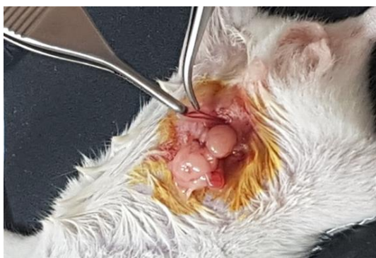
Figure 5. Vas deferens

Electrosurgery. The surgi-pen was plugged into the Bovie machine. Before setting up the electrical flow rate and frequency, the needle electrode was connected to the surgi-pen. Then the device was turned on, and the yellow pedal was pushed on the footswitch. In this step, a close contact is made between the needle electrode and shaved skin in the medial line of the abdomen (for detailed procedure see the supplementary video ). A 10 mm longitudinal skin incision was performed about 1 cm above the penis. After making 1 cm incision in the abdomen skin and body wall, the testicular adipose pad of one side was grabbed with micro-dissecting serrated forceps and pulled to expose testis, then the vas deferens was cut (Figure 5).