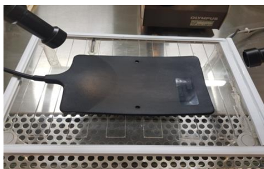
Figure 3. Rubber neutral electrode mounted on warm glass plate