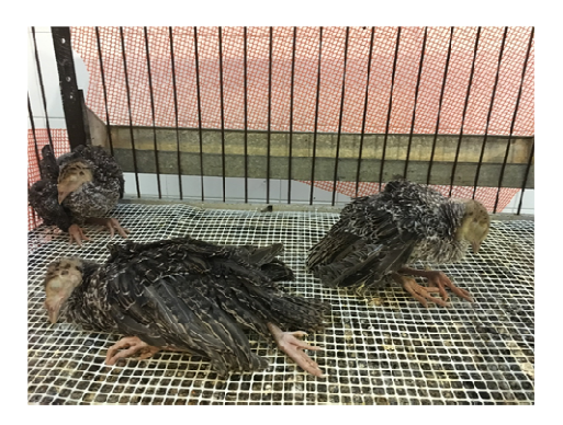
Figure 2. Severe depression and leg paralysis in poults infected with a velogenic chicken isolate of Newcastle disease virus 8 days postinoculation