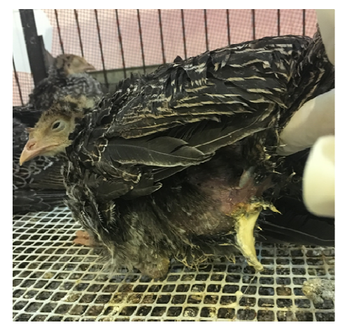
Figure 1. White diarrhea in a poult infected with a velogenic chicken isolate of Newcastle disease virus 6 days postinoculation

industry. Velogenic NDV is so virulent; accordingly,