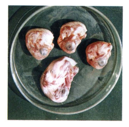
Figure 1. Comparison of normal 15-day-old embryo (right) and 3 curled stunted, infected embryos

During a time period of almost one year (early 2000-2001) trachea, lung, kidney and cecal tonsils from 29 commercial chickens were examined, of which layers were experiencing aberrant egg production, broilers showing respiratory and nephritis infections were followed by mortality resulting from coli-septicaemia. Following passages in embryonated chicken eggs, 12 of the samples caused embryo mortality and/or dwarfing, stunting and curling of the embryos (Figure 1).