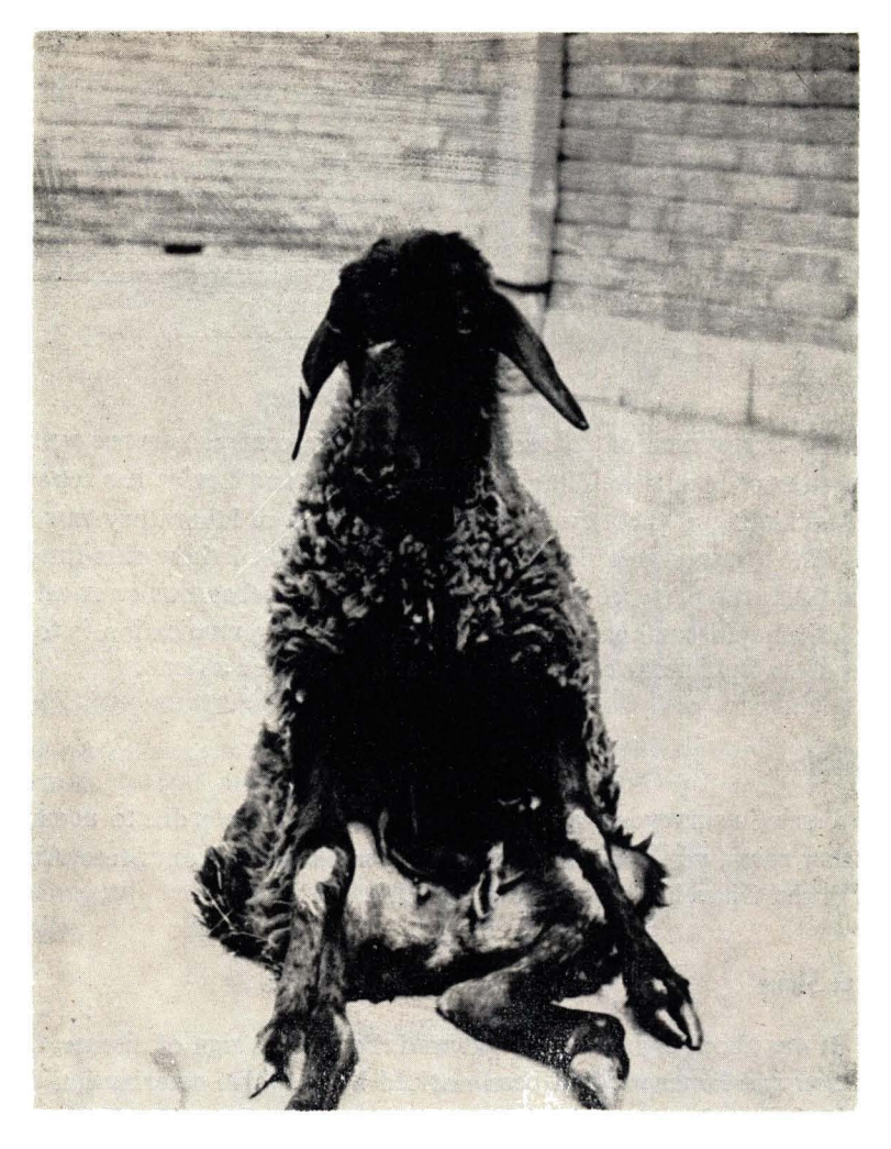
Fig. 1.—The lamb with complete lumbar paralysis. The hindlegs could not carry the body weight and so forced the animal to sit like a dog.

released the hindlegs could not carry the bodyweight, and the animal sat on them like a dog (Fig. 1).