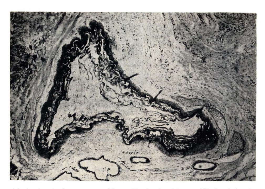
Fig. 4.—A section from upper part of the cyst. Note location of the cyst within the spinal cord. \times 40 .