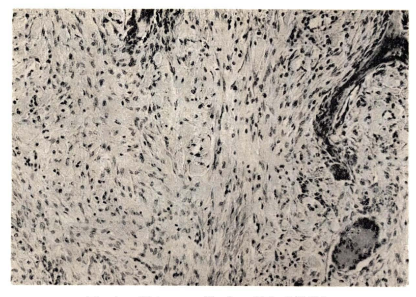
Fig. 4 = Higher magnification of Fig. 3 X 125.