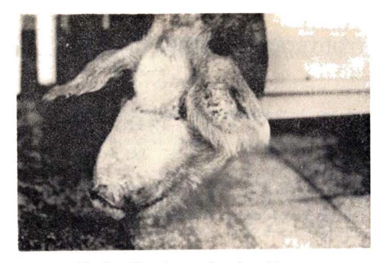
Fig. 1 = Note the extention of nasal bones.