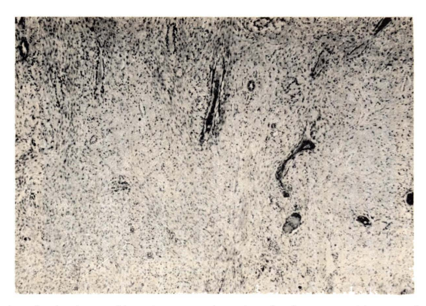
Fig. 3 = Section from turbinate bone. Note bone tissue has been replaced by white fibrous connective tissue X 40.