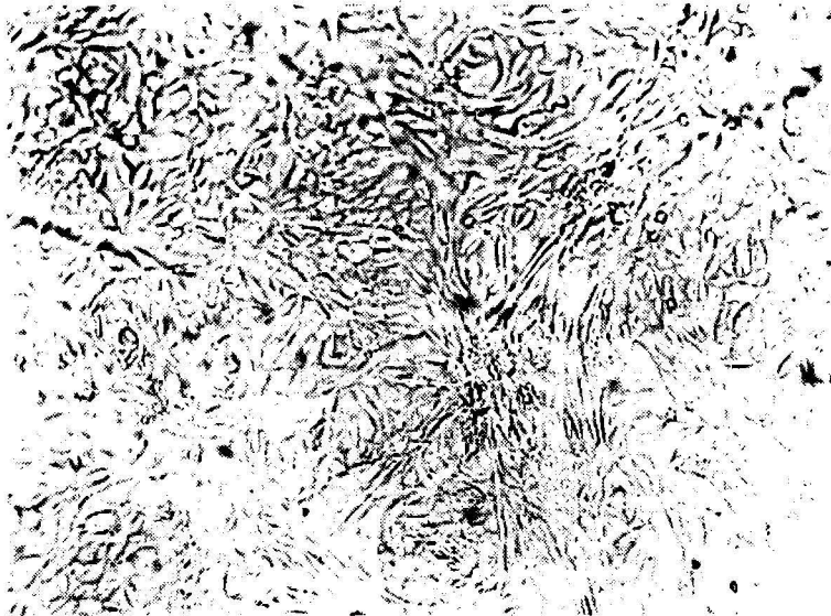
Fig. 1. Normal Kid Kidney Cell's (Control)