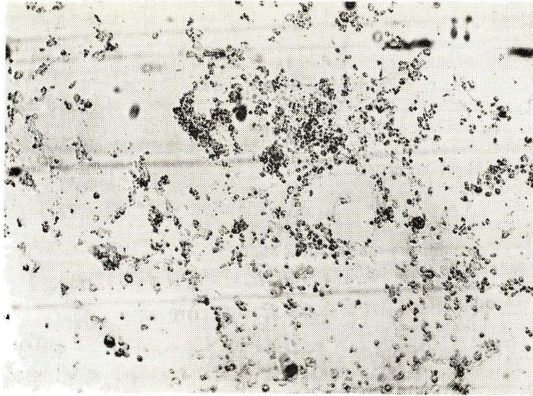
Fig. 3. CPE after 120 hours

Titration of virus: Ten-fold dilutions of the 5th KK and KT passages were separately prepared in VM 3 (virus medium 3) and inoculated in 0.2 ml. amount in each of 6 culture tubes. Infected cells were examined daily for CPE. The infectivity titer calculated according to KARBEN reached 10^{5.2}/\text{ml} .