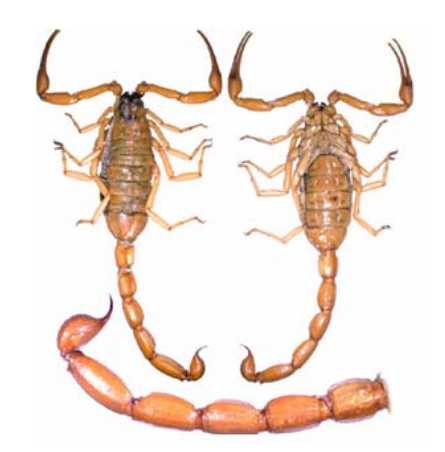
Figure 6. Hottentotta khoozestanus

The described features distinguish H. khoozestanus from all other species of the genus. They are recounted in the key below. Together with H. saulcyi (Simon 1880) and H. schach (Birula 1905), the new species is among the largest in the genus. The last species hitherto described from Iran is H. zagrosensis Kovařík, 1997. H. khoozestanus can be easily distinguished from the above named three species on two characters: (1) Hairless pedipalps and metasoma, which in the other three species are densely hirsute. And (2) coloration; whereas H. khoozestanus has the fifth metasomal segment and telson yellow, in the other three species those parts are black ( H. zagrosensis is entirely black).