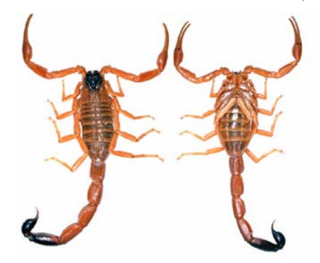
Figure 3. Hottentotta saulcyi Hottentotta schach (Birula 1905) (figure 4) Buthus schach, Birula, 1905:134.

In Iran: from Koozestan, Lorestan, Chahrmahal & Bakhtiyari, Kohgiluyeh & Boyreahmad, Bushehr, Fars and Ilam provinces (Navidpour et al 2008a, 2008b, 2008c, 2008d, 2010, Pirali-Kheirabadi et al 2009).