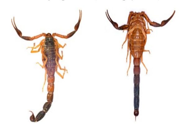
Figure 2. Hottentotta jayakari

In Iran: Hormozgan province(Farzanpay, 1988)