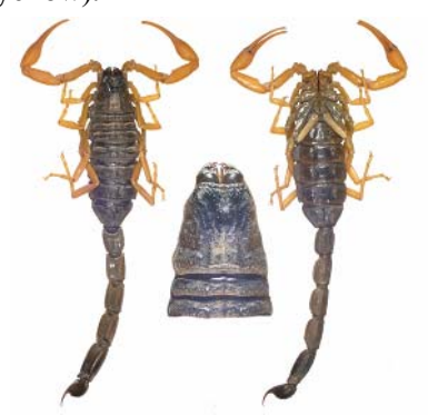
Figure 7. Hottentotta lorestanus

fixed fingers, with 13 MD rows. Mesosomal sternite VII smooth, with 4 smooth carinae. Metasomal segments I to III with 10 carinae; segment IV with 8 carinae and segment V with 5 carinae, 3 ventral (1 median, 2 lateral) and 2 dorsal. Dorsal carinae of metasomal segments bear terminal granules of size approximately equal to pre-ceding granules. Dorsal surface smooth. All metasomal segments longer than wide. The described features distinguish H. lorestanus from all other species of the genus. They are recounted in the key below. Together with H. khoozestanus Navidpour et al., 2008, H. saulcyi (Simon, 1880), and H. schach (Birula 1905), the new species is among the largest in the genus. H. lorestanus can be easily distinguished from H. khoozestanus Navidpour et al., 2008 by its nearly entire body being hirsute. H. lorestanus can be easily distinguished from the other above named three species by coloration; whereas only H. lorestanus has pedipalps entirely yellow (H. zagrosensis has pedipalps entirely black, and H. schach has a black chela of pedipalps) and metasomal segments I to IV are greenish gray (in H. saulcyi, these segments are yellow).