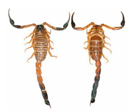
Figure 4. Hottentotta schach

Hottentotta zagrosensis Kovařík 1997(Figure 5)