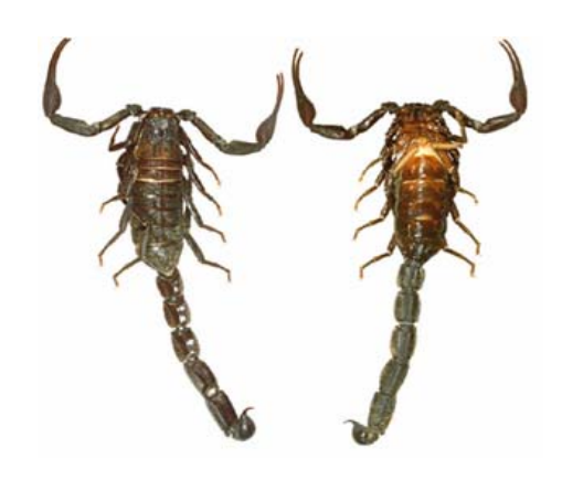
Figure 5. Hottentotta zagrosensis

DISTRIBUTION: Iran (Kovařík, 1997a: 41), Koozestan, Chahrmahal&Bakhtiyari, Kohgiluyeh & Boyreahmad and Fars provinces.(Navidpour at al ,2008a, 2008d, 2012, Pirali-Kheirabadi et al 2009.