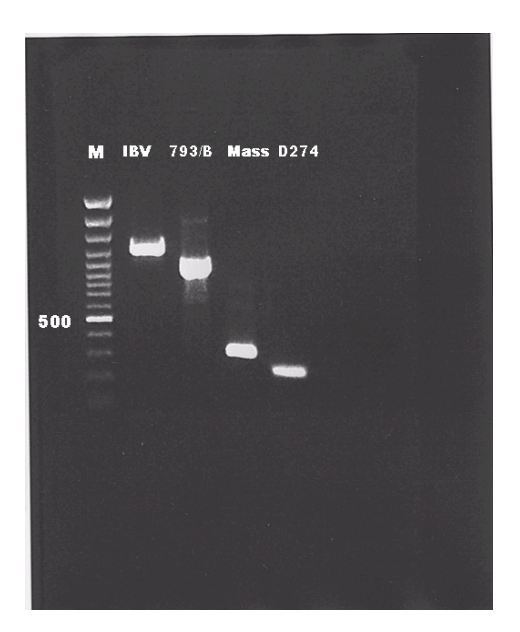
Figure 1. The typical results of molecular tests. The PCR products of 1200, 972, 295 and 217 bps length were amplified for detection of IBV, 793/B, D274 and Massachuset types respectively.

The typical results of molecular tests were shown in figure1. The obtained results in each year have separately been presented in table 1 and readers to be referred to this table for more details. In general out of 150 tested flocks approximately 72% were IBV positive in RT PCR tests. Specific nested PCRs on RT- PCR products revealed that 57 flocks (52.7%) were infected by 793/B type IBV alone. Massachusetts type IBV also could be detected in 18 flocks (16.6%) alone. Thirty three (30.5%) flocks were infected with both 793/B and Massachusetts type IBV as a mix infections. In general, out of 108 IBV positives flocks, 90 flocks (approximately 83%) were infected with 793/B type IBV (figure 2).