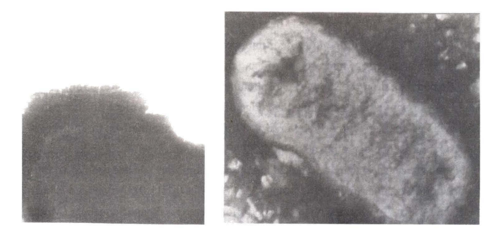
Figure 1. Electron micrograph of E. coli 583 grown on TSA at 37^{\circ}C stained with 2% phosphotungstic acid showing long, thin fimbriae attached to the surface of the cell. X70,000. (left). Electron micrograph of E. coli 583 grown on TSA at 16^{\circ}C stained with 2% phosphotungstic acid. Cell was nonfimbriated when grown on TSA at 16^{\circ}C . X60,000 (right).

on TSA were long and straight and had a diameter of approximately 8nm (Figure 2). The average yield of F11 fimbriae from 10 liters cultures was 1.7mg. The level of purity was very high after gel filtration.