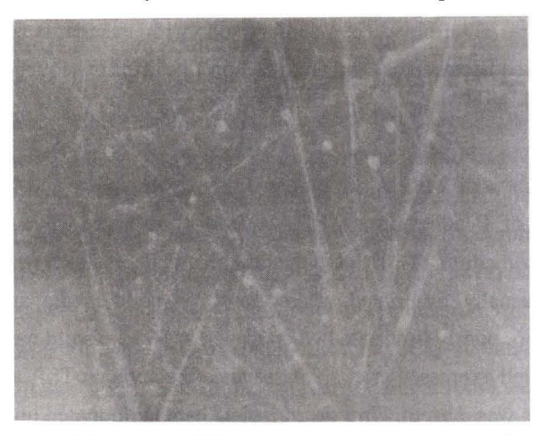
Figure 2. Fimbriae isolated from E. coli 583 negatively stained with 2% phosphotungstic acid. The fimbriae had a diameter of approximately 8nm. X125,000.