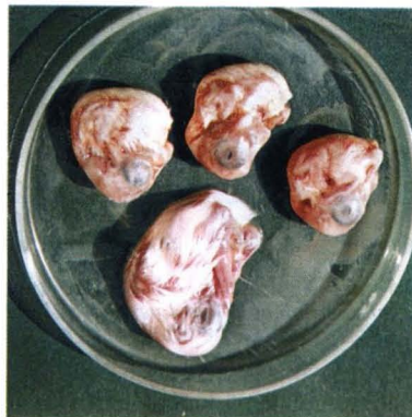
Figure 1. Comparison of normal 15-day-old embryo (right) and 3 curled stunted, infected embryos

During a time period of almost one year (early 2000-2001) trachea, lung, kidney and cecal tonsils from 29 commercial chickens were examined, of which layers were experiencing aberrant egg production, broilers showing respiratory and nephritis infections were followed by mortality resulting from coli-septicaemia. Following passages in embryonated chicken eggs, 12 of the samples caused embryo mortality and/or dwarfing, stunting and curling of the embryos (Figure 1).