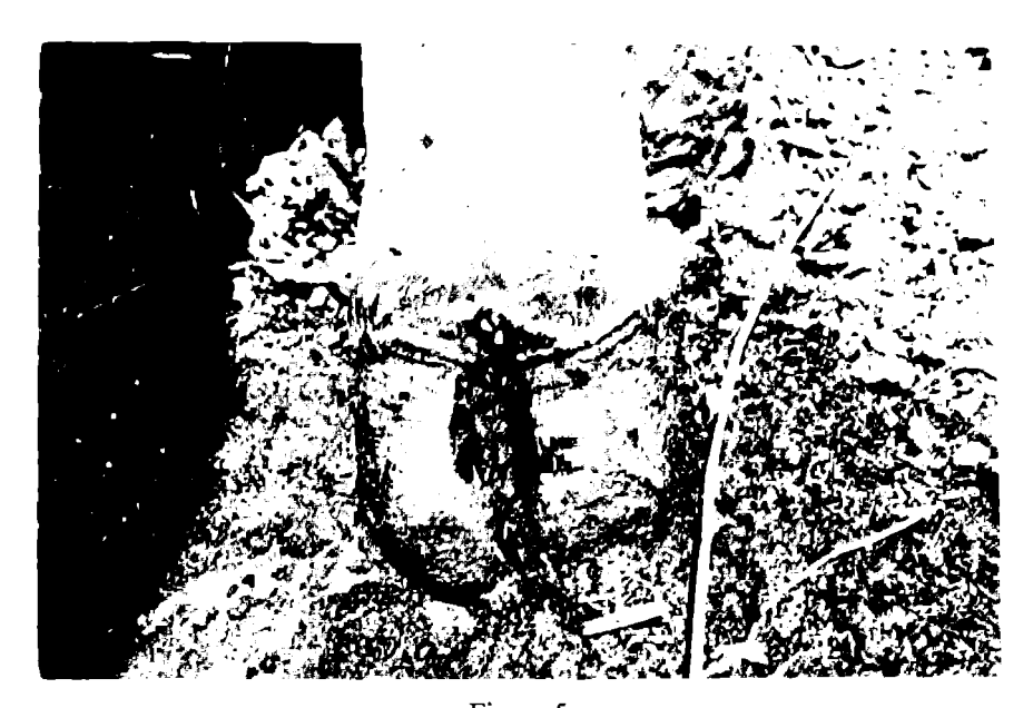
Figure 5. Lesion on the claw of a cow.