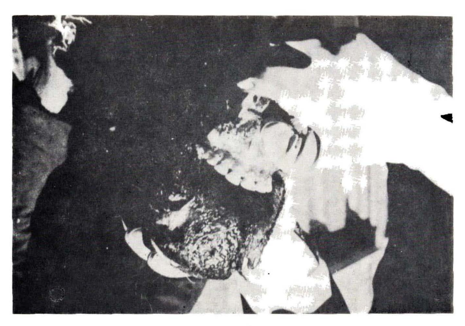
Figure 4. Lesions on the gingiva of a cow.