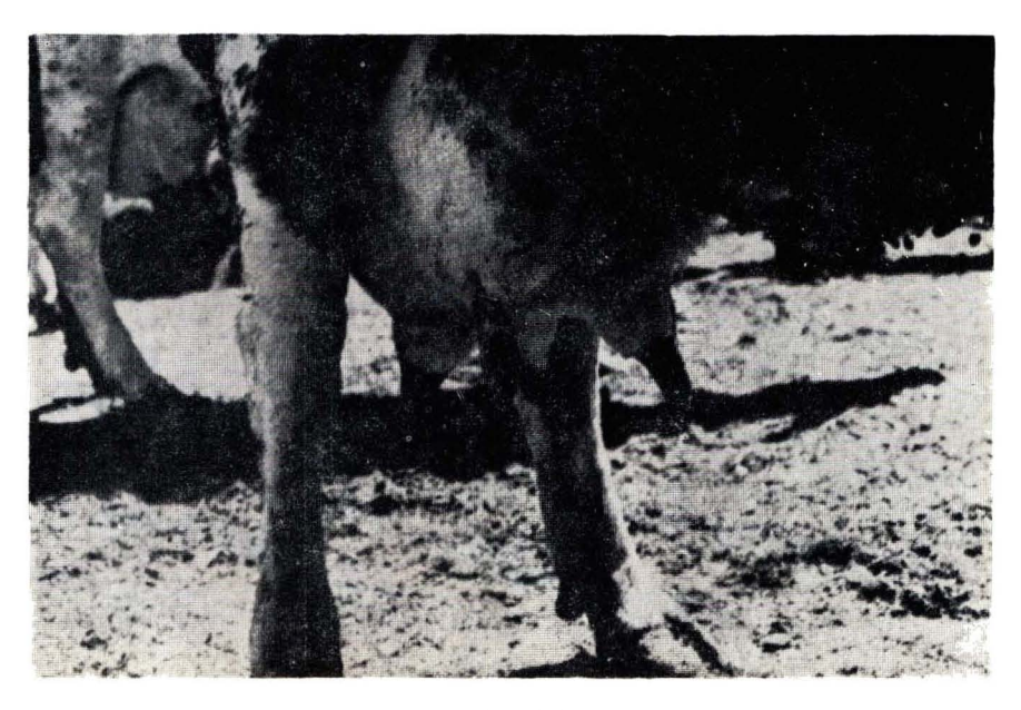
Figure 2. Lesions on the teats of a cow.