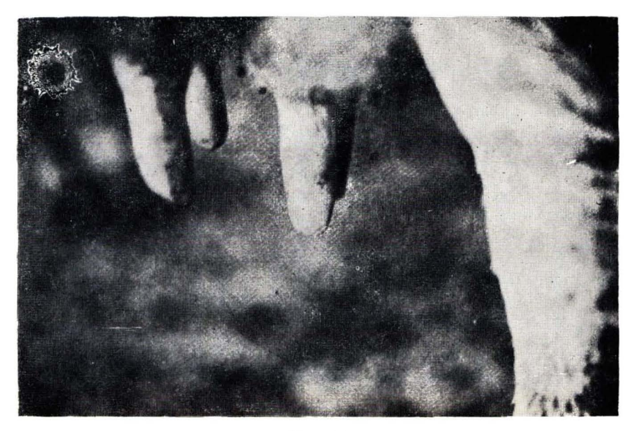
Figure 1. Apparition of a vesicle on the teat of a cow