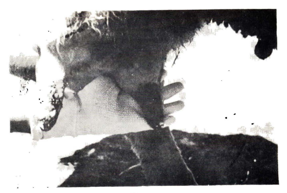
Figure 3. Advanced lesions on the teats of a cow